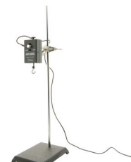
Mounted for vertical data collection

You should not have to perform a new calibration when using the Dual-Range Force Sensor in the classroom. The sensor is sensitive enough to measure the weight of the sensor hook. To minimize this effect, simply place the sensor in the orientation in which it will be used (horizontal or vertical) and choose zero in the software. Much like pressing “Tare” on a scale, zeroing will define the current situation as 0 N of force.