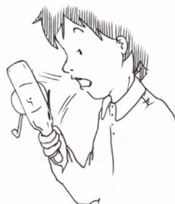
Fig. 2 Humidifying the Unit when the air is dry